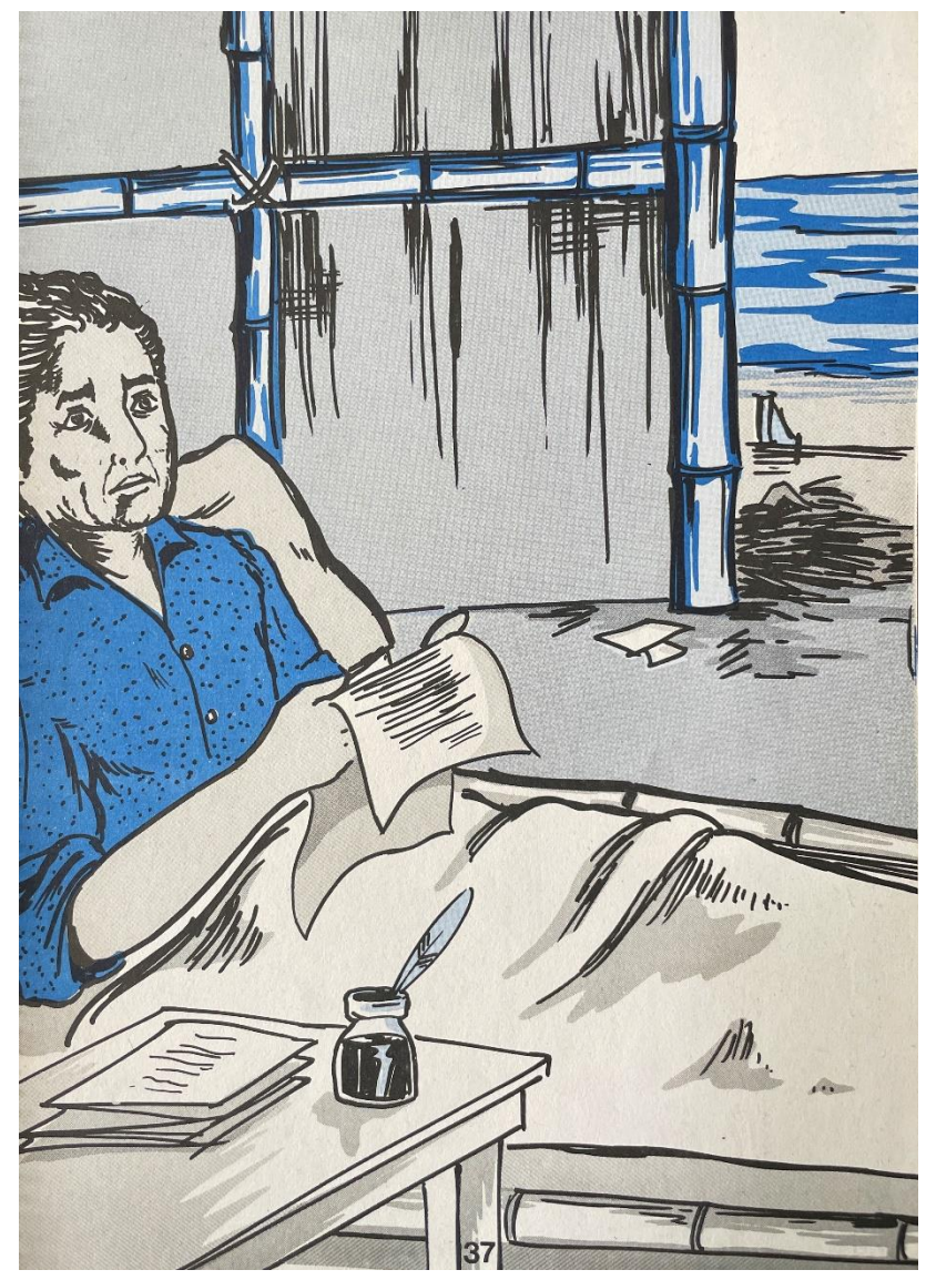
The King of Burma needed Adoniram's help to translate letters from General Campbell. Adoniram remained faithful in the translation work, so that peace could be brought upon the Burmese people.