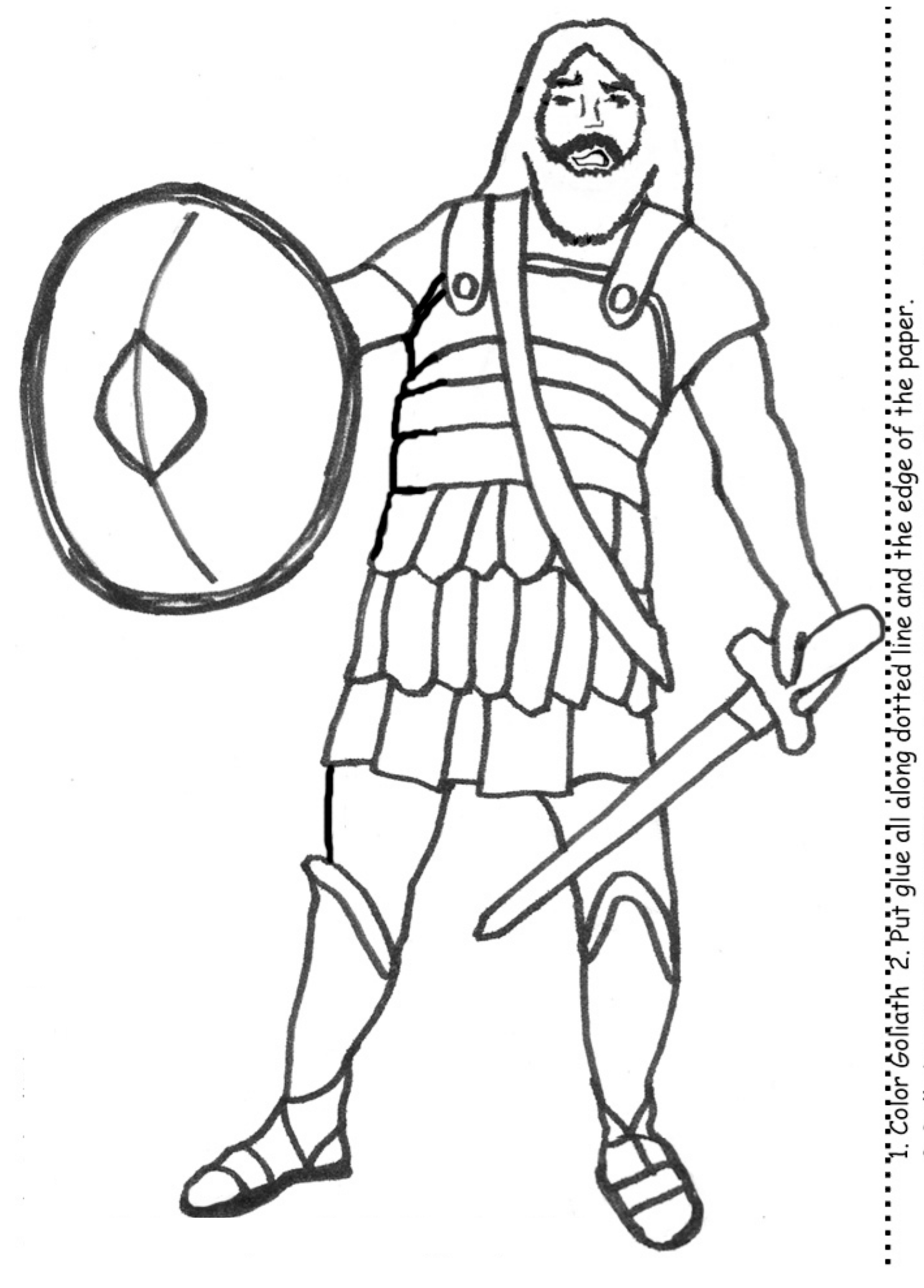
3. Roll the opposite edge of the page behind Goliath and bring it around over the

glue to meet the dotted line. 4. Stand Goliath up